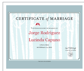
"Winter Red Birds"

All designs are available for both marriages and civil unions. Commemorative certificates are not legal documents, but a certified legal certificate is included with each purchase. Frames are not included.