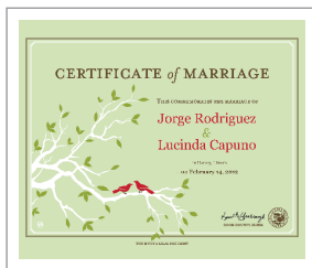
"First Birds of Spring"