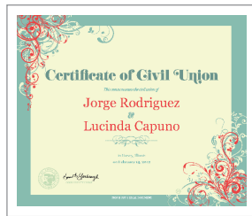
"Classic Flourish, Blue"