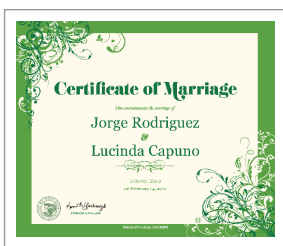
"Classic Flourish, Green"